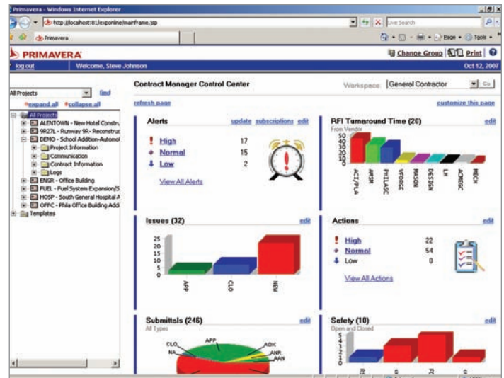
Role-based dashboard displaying key performance indicators across multiple projects and programs.

With Contract Manager, accurate and up-to-date information is always accessible. Primavera provides role-based dashboards with key performance indicators and powerful reports. Gain visibility early so you can prevent minor issues from becoming major problems. With a personal dashboard, you can view the latest project status and new issues, and be alerted about potential problems. With two clicks, access project details necessary to make decisions and to keep projects on schedule. Use any of the 150 standard reports, or create your own, to track budgets, cost variances and project changes, and to analyze comparative trends and cause/effect among multiple projects.